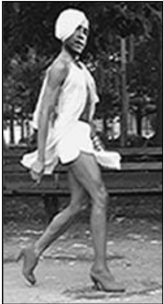
Obongo, in native garb, on his recent Indonesian vacation, strolling in his old Jakarta neighborhood

standard cleansing ritual; the village chief gave the owner of the cow the equivalent of $562; & the seductive cow was — reportedly — drowned in the sea to rid the village of bad luck.