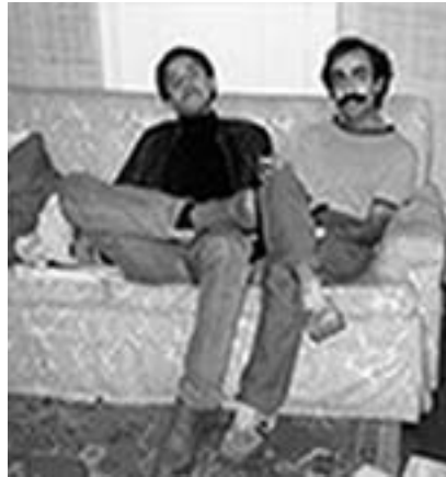
College-boy Obongo & his Pakistani roommate, 1985

The right to free speech & the right to a free press is attacked in a sneaky, roundabout way under Obongo-care, with IRS & the death-panels as enforcers. Most people, bless page 12